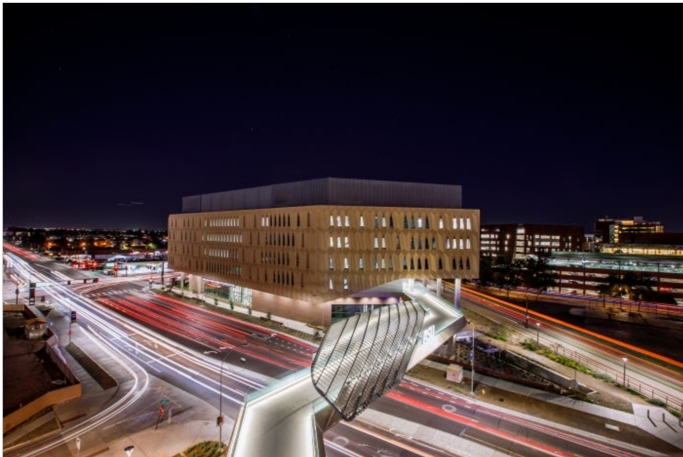
Photo of the Walton Center for Planetary Health on ASU's Tempe campus.